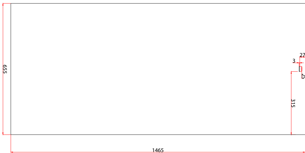
Solar cells: FR4 655*1465*1.5mm